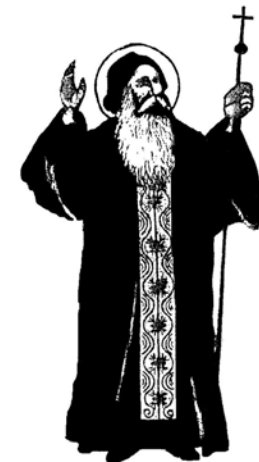
ST. MARON, ABBOT FATHER OF THE MARONITE CHURCH